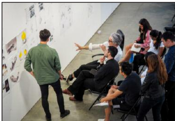
Typical architecture “crit.”

We students stood at the pin-up wall, bleary-eyed from staying up all night, our hearts and souls laid bare in thin, measured ink lines. We most often faced definition #2, some professors seemingly finding joy in humiliating us, without giving us road maps to a better end. (As organists, I suspect the feelings of being exposed and facing criticism ring true.) Sadly, the critical mindset got imbedded into us as practicing architects.